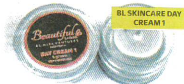
BL SKINCARE DAY CREAM 1

PRODUK keluaran Biela Beauty dan BL Skincare yang dilaporkan mempunyai racun berjadual.