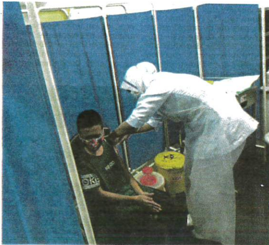
A child getting a Covid-19 vaccine at a clinic in Air Itam, George Town, last month. FILE PIC

He said the rate of samples testing positive for influenza-like illness in EW26 dropped by 21.7 per cent, and the positive rate of severe acute respiratory infection samples remained at zero per cent. Bernama