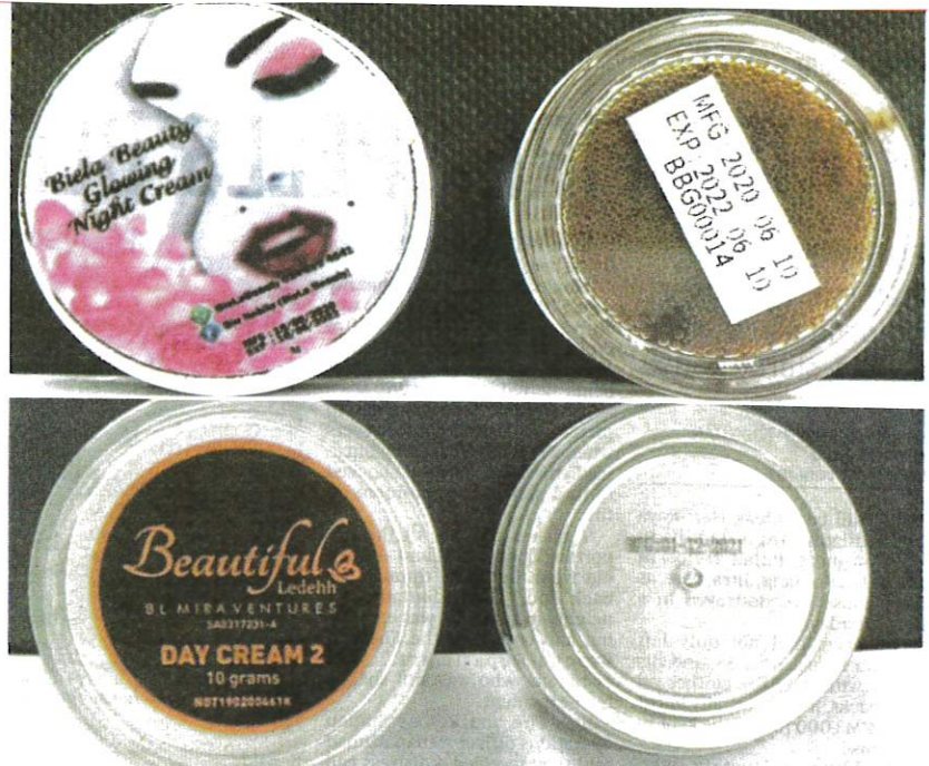
Biela Beauty Glowing Night Cream (top) and BL Skincare Day Cream 2 (bottom) are two of the four cosmetic products no longer allowed to be sold in Malaysia as they contain scheduled poisons.

He added that hydroquinone could cause redness on the part of the skin where it was rubbed, discomfort, unwanted skin dis-