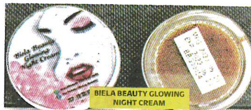
BIELA BEAUTY GLOWING NIGHT CREAM

"Hydroquinone boleh menyebabkan kemerahan pada kulit selain meningkatkan risiko kanser, manakala penggunaan tretinoin tanpa pengawasan boleh mengundang risiko tidak selesa, pedih dan hipersensitif kepada cahaya matahari," jelas beliau.