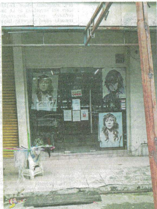
Beauty and the beast: The facade of a beauty salon which also offers dentistry courses.

"Any improper treatment can cause the patient to suffer conse-