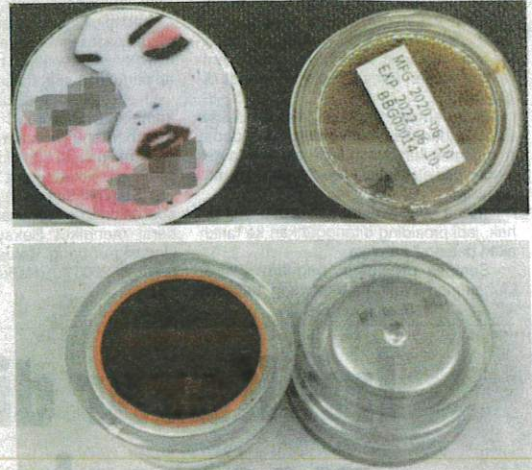
Empat produk kosmetik yang dikesan mengandungi racun berjadual.

Katanya, penjual dan pengedar produk kosmetik itu perlu menghentikan penjualan dan pagedaran produk kosmetik tersebut dengan serta-merta kerana melanggar Peraturan-peraturan Kawalan Dadah dan Kosmetik 1984. - Bernama